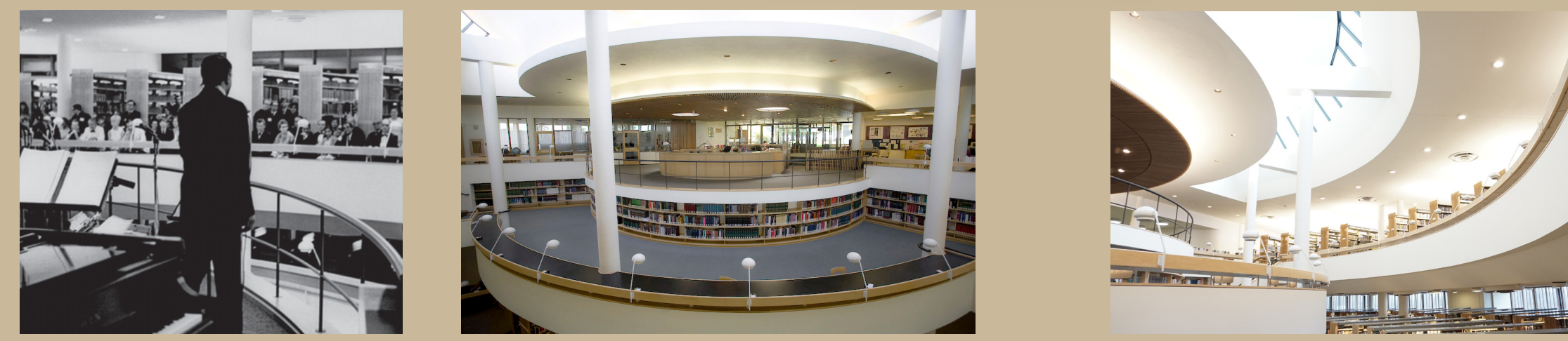
In May of 1970, the music of Duke Ellington reverberated throughout the open space, to the delight of the hundreds of guests attending the library's dedication.

Read more about the library, its architecture, rare books, illustrated manuscripts, and vast theology collection at mountangelabbey.org/library.