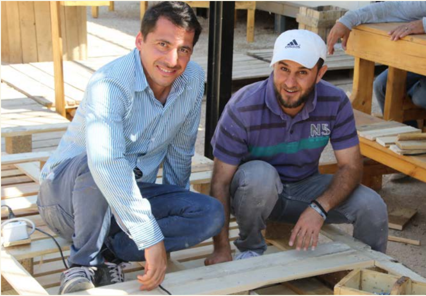
Iraqi men take a break from making furniture at a United Nations refugee camp in Jordan. The camp was one of the stops on the CRS trip last spring and an example of the Iraqi Livelihoods Project, teaching new skills to men and women confined to refugee camps.

housed Iraqi refugees who had to flee from the oil fields in Iraq where they were working when ISIS forces approached.