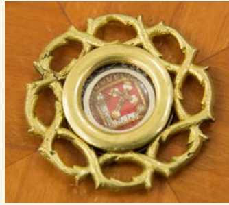
Among the relics at the Abbey, there is what is believed to be a fragment of the true cross. It is kept in a small case set into a large wooden reliquary shaped in the form of a cross (shown here and on the cover). During the Good Friday liturgy, the monks approach and venerate that holy relic.