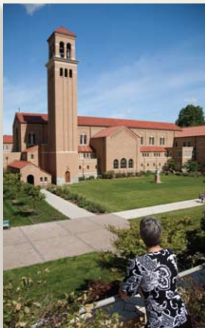
A guest enjoys the view from the Retreat House terrace.

Men and women of all faiths are welcome to spend time in prayer and reflection in the peaceful atmosphere of Benedictine monastic life and the unique natural environment of our hilltop. The monks of Mount Angel Abbey and the Retreat House staff look forward to your visit. Reservations can be made at www.mountangelabbey.org or 503.845.3025.