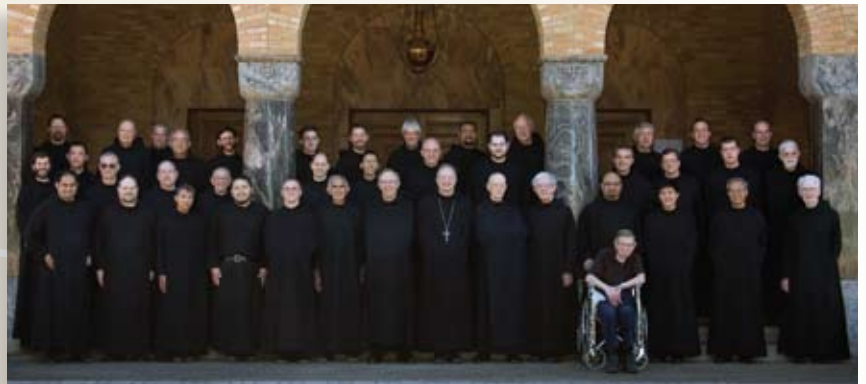
A new community photo is taken each year at the end of the annual retreat.

the Retreat. It is remarkable how different our monastic home seems during a retreat - the place is the same, but due to the silence and the clear spiritual focus, we experience God differently during a retreat than we do during the rest of the year. Each annual community retreat is a blessed time of spiritual renewal.