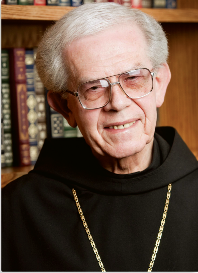
Right Reverend Gregory Duerr, OSB Abbot

“We are an important part of the religious heritage of our world. We have prepared over 1,000 men to become priests in 14 countries through Mount Angel Seminary.”